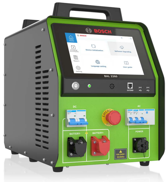
Bosch BAL 2260 charger/discharger – featuring automatic online updates, situation alarm and detailed test reports