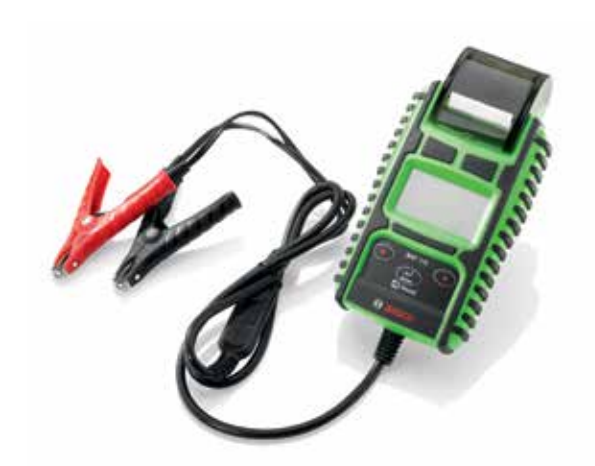
BAT 115 Battery tester (with integrated printer)