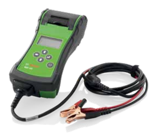
BAT 131 (with integrated printer)